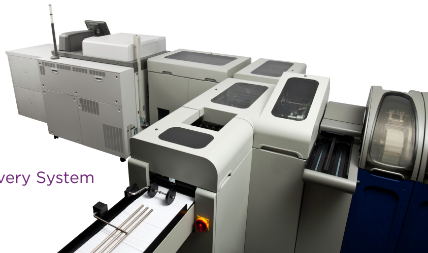
MXD610 Card Delivery System

Support market trends: Meet the growing vertical card trend without limiting job sizes based on card orientation. Dynamically place cards on carriers horizontally and vertically to meet customer requests.