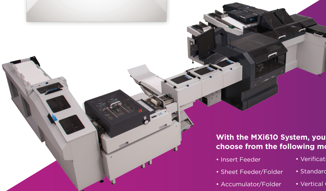
MXi610 Envelope Insertion System