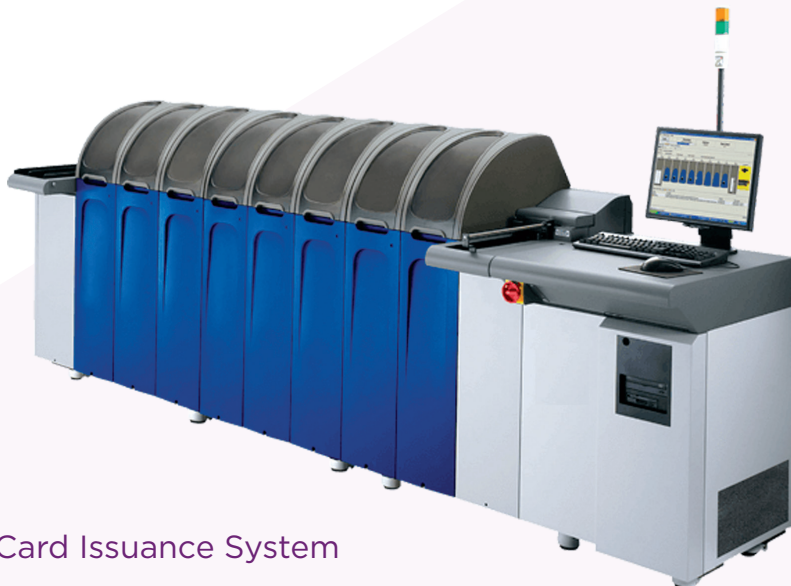
MX6100 Card Issuance System

Service and support: The MX Series Systems are supported by the industry's largest service and support network, which spans more than 150 countries worldwide. Online and phone support is available 24/7.