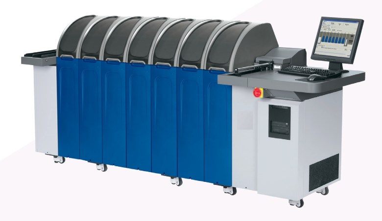
MX2100 Card Issuance System

Service and support: The MX Series Platform is supported by the industry's largest service and support network, which spans more than 150 countries worldwide. Online and phone support is available 24/7.