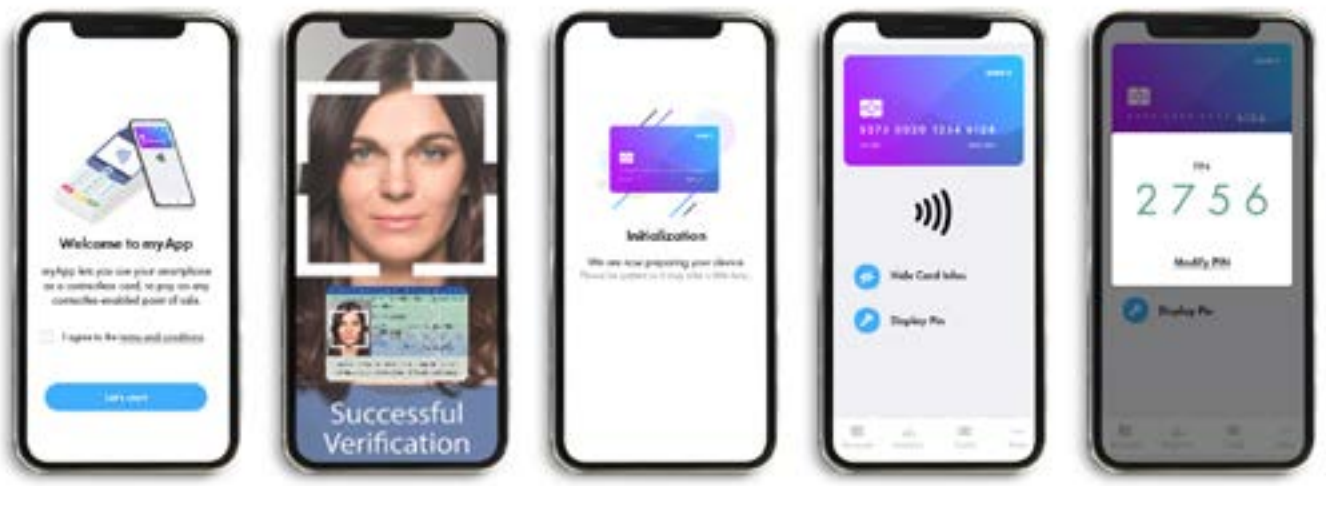
Welcome and Initialization